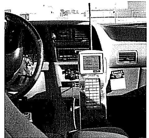
This stationary bracket cradle for meter readers was created by Loren Unruh of Merced Irrigation District.